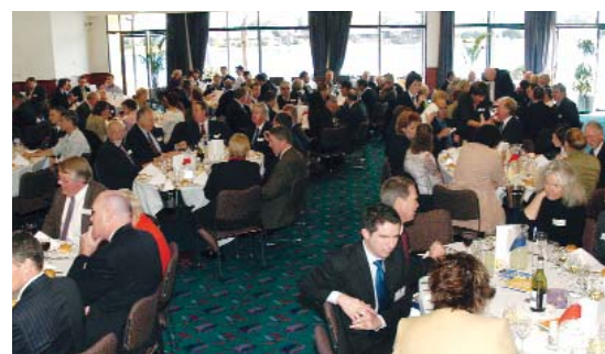
Above: Guests enjoying themselves