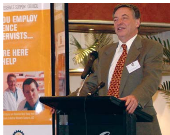
Above: Senator The Hon. Robert Hill - Minister for Defence

As guest of the Defence Reserves Support Council, Minister Hill discussed the link between the Australian Defence Force and South Australian business to over two hundred guests at the luncheon in June.