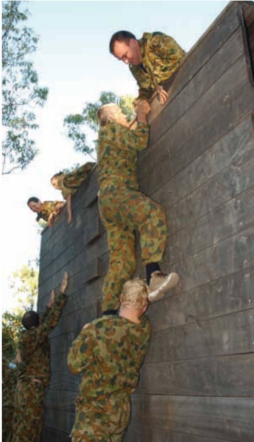
Above: They make the bosses work hard for their rations on Executive Stretch exercises in the Northern Territory...and teach them that teamwork can overcome the tallest obstacles.

NT conducted another EES in April 2005, with ABC Television producing a documentary (due to air mid-year). The documentary will be shown on 'The