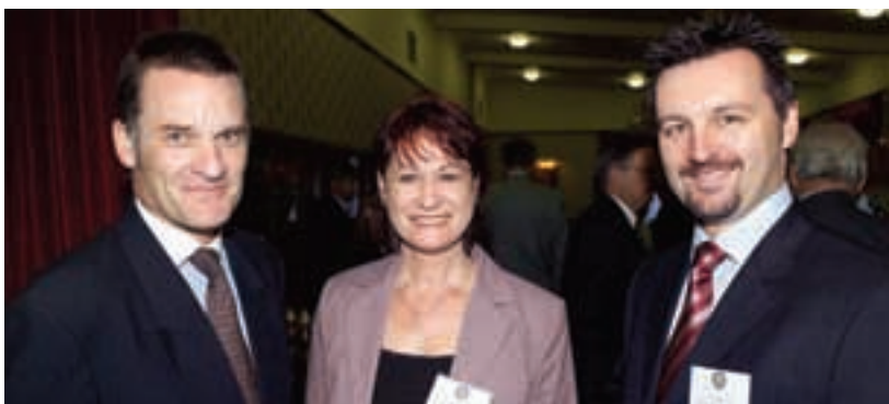
Above & below: South Australian DRSC committee members and 'Friends of DRSC' enjoy breakfast at Keswick Barracks Officers Mess.

The committee has also approached local councils to institute Defence leave policies provisions in Local Government.