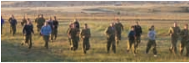
Left: Physical training on a Sunday – at 6am – was a new experience for some on the Tasmanian Exercise Executive Stretch at Pontville.