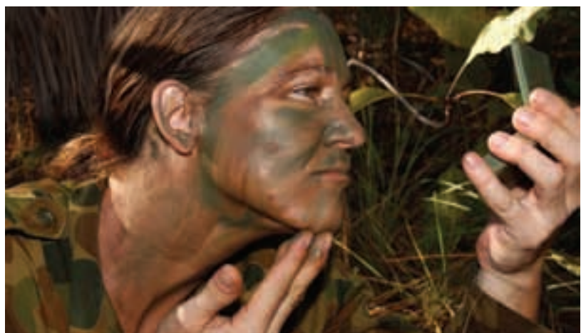
Above: Always take your makeup along for an Executive Stretch exercise in the NT: you never know when you'll have to look your most inconspicuous.

The event was significant for the central region of Australia, illustrating that Defence is necessary in depth, not just along the coast line.