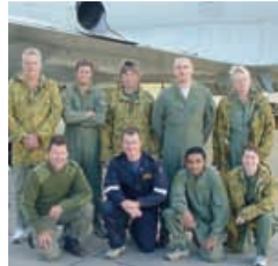
Right: The 'Navy' team on Exercise Executive Stretch 2005 after their tour of an Air Force P-3C Orion.