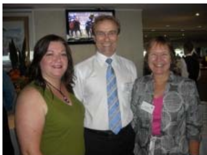
2008 Christmas Race Day