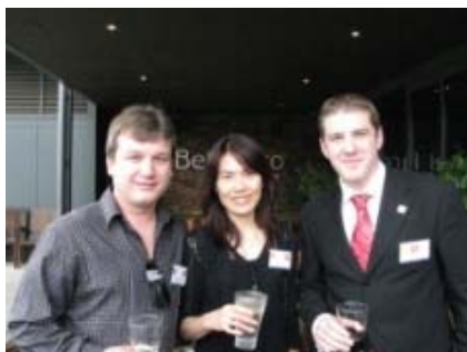
CX's Dining Etiquette Series